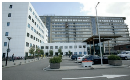
Erasmus MC, University Medical Centre, Rotterdam

Registration fee: EUR 750,- +tax Please register online: http://www.training-for-excellence.eu