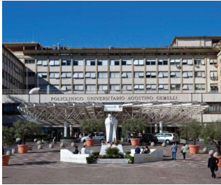
Policlinico Gemelli, Rome